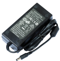
24V 2.5A Power adapter