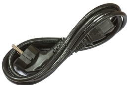
2 IEC cords