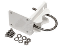
LHG precision mount